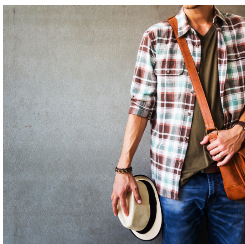
Men's Plaid Shirt $45