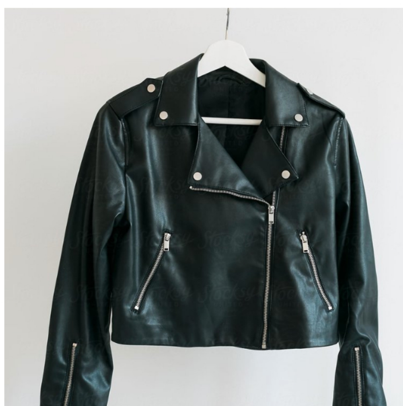
Leather Jacket $850